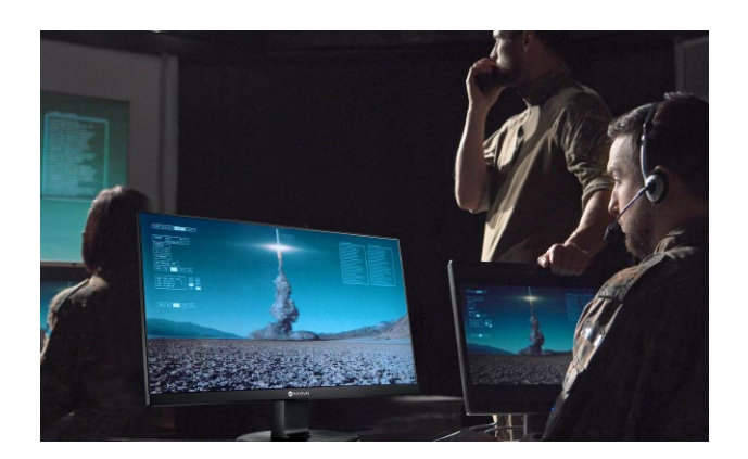
AG Neovo SC-Series