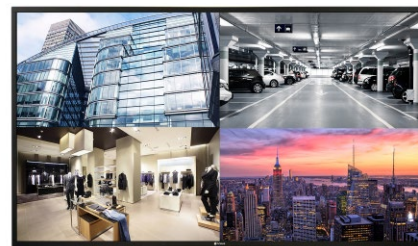
4K UHD @ 60 Hz

The QD-Series are crafted specifically to transcend the challenge of enduring 24/7 operations. AG Neovo's Anti-Burn-in™ technology also spares them ghosting while performing mission-critical nonstop operations. Metal casing and rigorously selected components not only help do the trick but also keep maintenance easy.