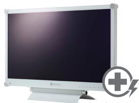
IEC/EN 60601-1 Medical-Grade Power Supply

The MX-Series adopts a specially designed low-voltage medical-grade power supply to ensure safety, performance, and reliability in any professional medical environment. Compliance with the IEC/EN60601-1 standards ensures their safe and reliable performance in demanding medical settings.