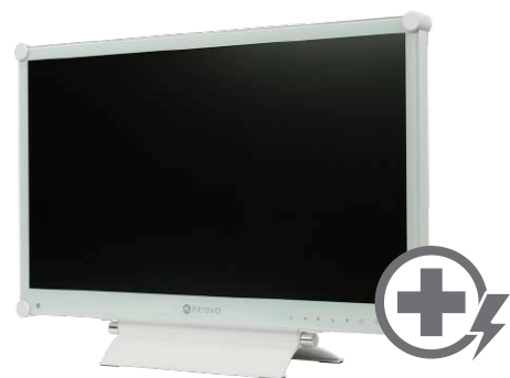
IEC/EN 60601-1 Medical-Grade Power Supply

The MX-Series adopts a specially designed low-voltage medical-grade power supply to ensure safety, performance, and reliability in any professional medical environment. Compliance with the IEC/EN60601-1 standards ensures their safe and reliable performance in demanding medical settings.